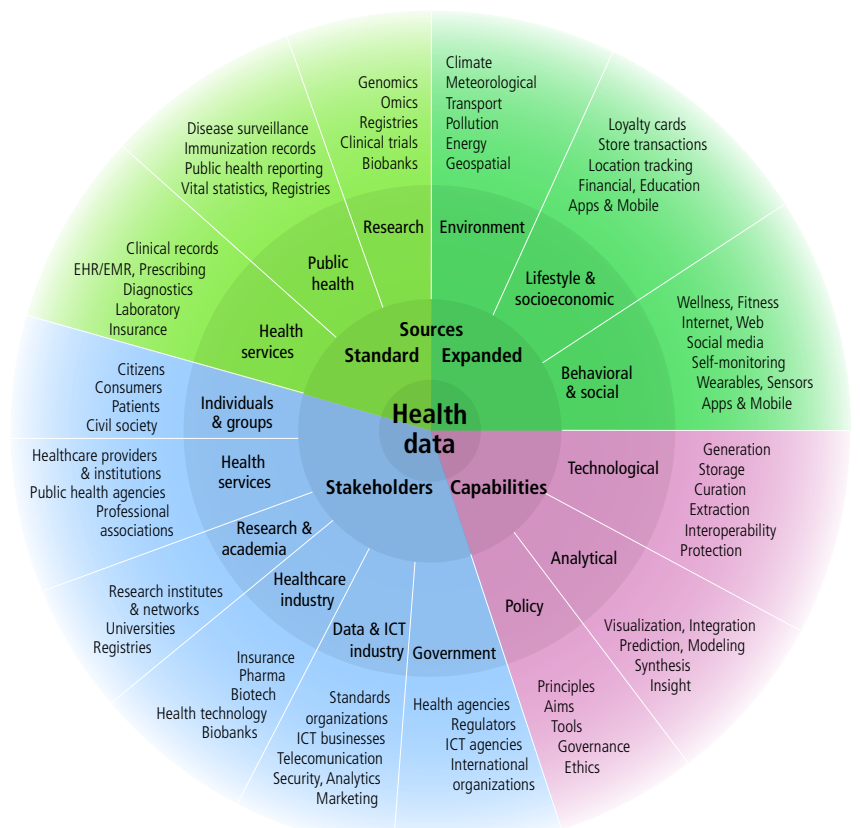
Fig. 1. Health data ecosystem

E. Vayena, J. Dzenowagis, M. Langfeldt, 2016